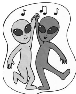
HERMAN BY JIM UNGER